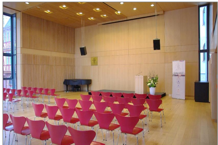
Conference room „Großer Saal“