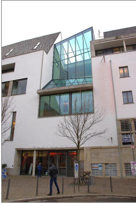
Exterior view Haus am Dom