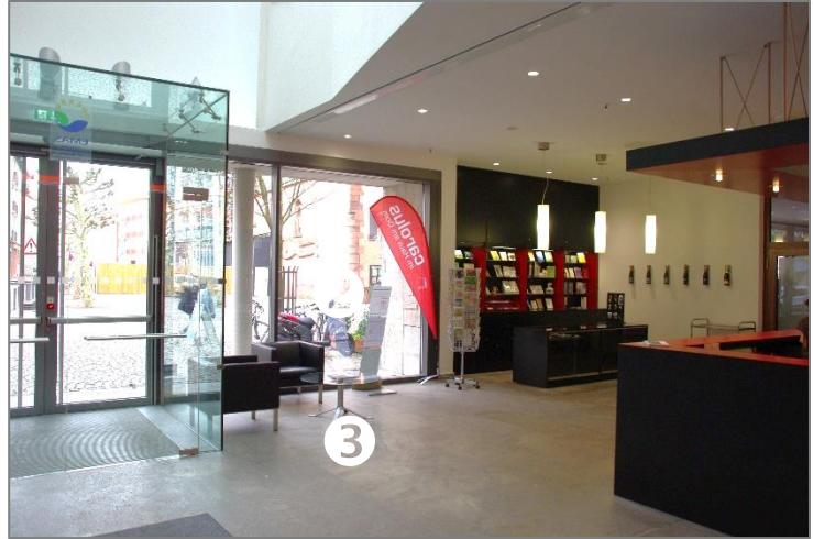
Exhibitor space in the registration area