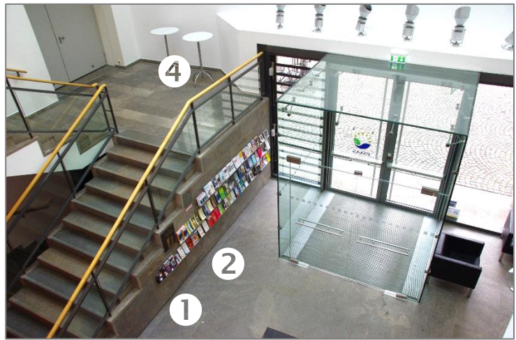
Exhibitor spaces in the registration area and access