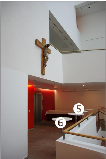
Exhibitor spaces in front of the conference room